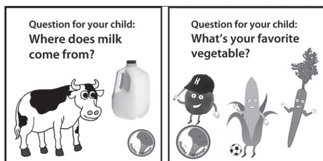
Fig. 1. Examples of signs posted in either the milk or frozen vegetables section of the supermarkets.

Up). Twenty-nine adult-child groups appeared to be Caucasian, four groups appeared to be African American, and one group appeared to be Asian.